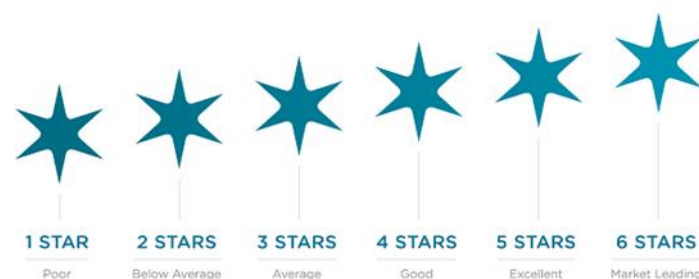
Figure 4 - NABERS Star Scale

The National Australian Building Energy Rating Scheme (NABERS) is a performance-based tool used to measure the operational impacts in existing buildings. The NABERS rating scheme rates energy, water, waste and IEQ in offices, shopping centres, data centres, hotels, and apartment buildings. Depending on the building type, the base building, tenancy or whole building can be rated.